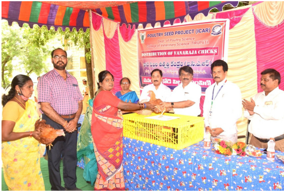
Distribution of Vanaraja Birds in Adopted village of SVVU