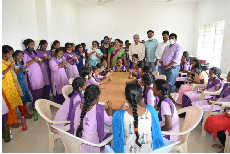
Girl students taking Millet Snacks on International Year of Millets during March 2023 at KVK Guntur