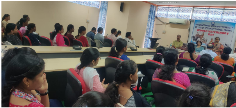
World Veterinary Day Celebrated on 29-4-2023