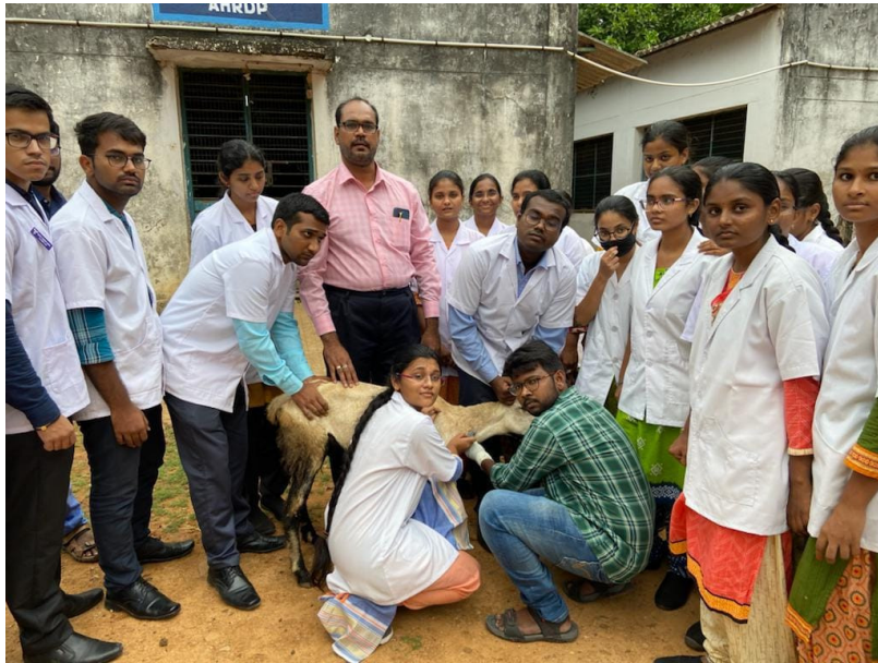
Students Participated in NSS Activities in rural Area