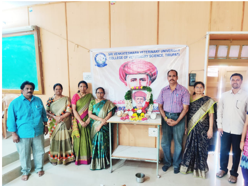
Mahatma Jyothirao Phule Birth Day Celebrated on 11-4-2023